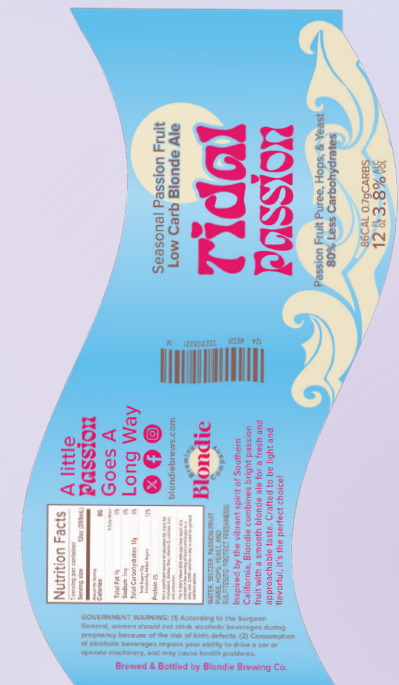
Blondie Brews Bottle Wrap