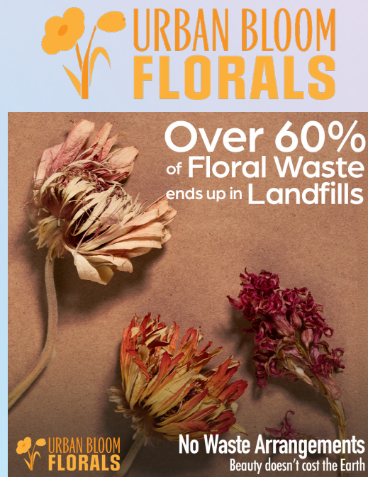
Educational Social Media Post